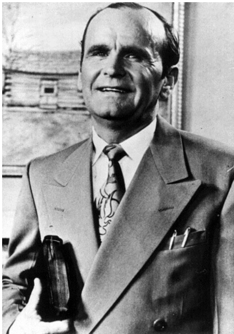
William Marrion Branham